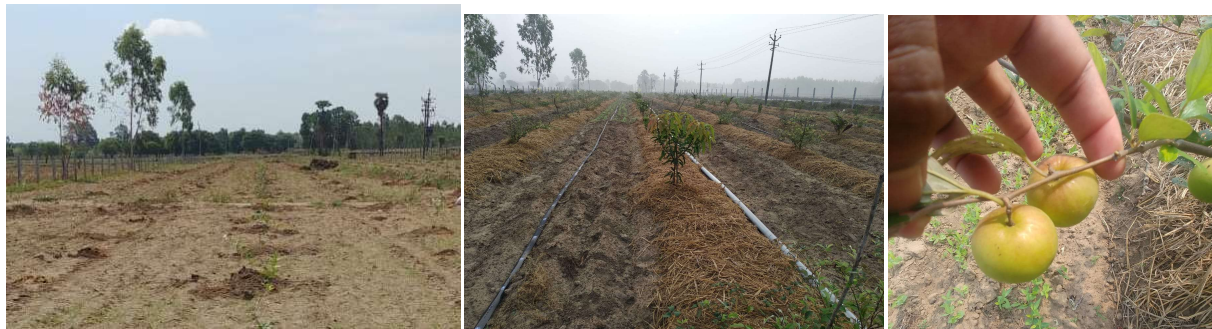
Six months ago

Firstly, on behalf of team tharunam, we wish you and your family a very happy new year.